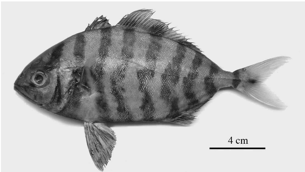
FIG. 3. – Seriola fasciata specimen, after defrosting.

Seriola fasciata . D 1 : VIII, D 2 : I+32, A: II+I+19, P: I+19, V: I+5, C: 22 (soft). TL 198 mm, FL 177 mm, SL 168 mm, weight 133.5 g. H 38.2 SL, h 5.9 SL, lpc 9.4 SL, HL 28.6 SL, Oh 22.5 HL, prO 32.1 HL, poO 47.9 HL, iO 40.8 HL, bD 1 10.7 SL, bD 2 45.2 SL, bA 27.1 SL, PL 14.7 SL, VL 21.5 SL, V-A 30.4 SL, pD 27.9 SL, pV 31.5 SL, pA 60.2 SL. The body is elongated, laterally compressed, with terminal mouth. The two dorsal fins are not connected to each other. The