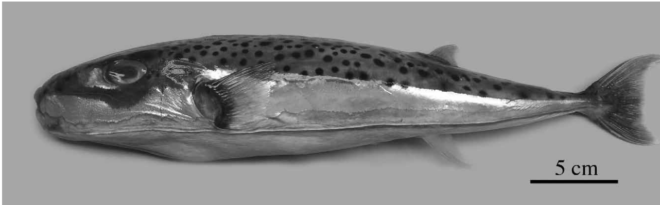
FIG. 2. – Lagocephalus sceleratus specimen, after defrosting.

HL, bD 5.5 SL, bA 5.2 SL, PL 12.2 SL, pD 66.0 SL, pA 65.7 SL. The body is elongated. The dorsal and anal fins are posterior in position and opposite, the caudal fin is lunate. Small spinules are present on the dorsal area, extending from behind the upper lip to the dorsal fin, while ventrally the spinules do not reach the anus. No scales are present on the rest of the body surface. Colour of defrosted specimen: dorsally it is greyish to greenish with circular or ellipsoid black spots. A silver band originates from behind the upper lip and extends to the caudal fin base. In front of and below the eye a silver blotch almost reaches 1/3 of the horizontal eye diameter. The belly is whitish. The pectoral base and inside of gills are black (Fig. 2).